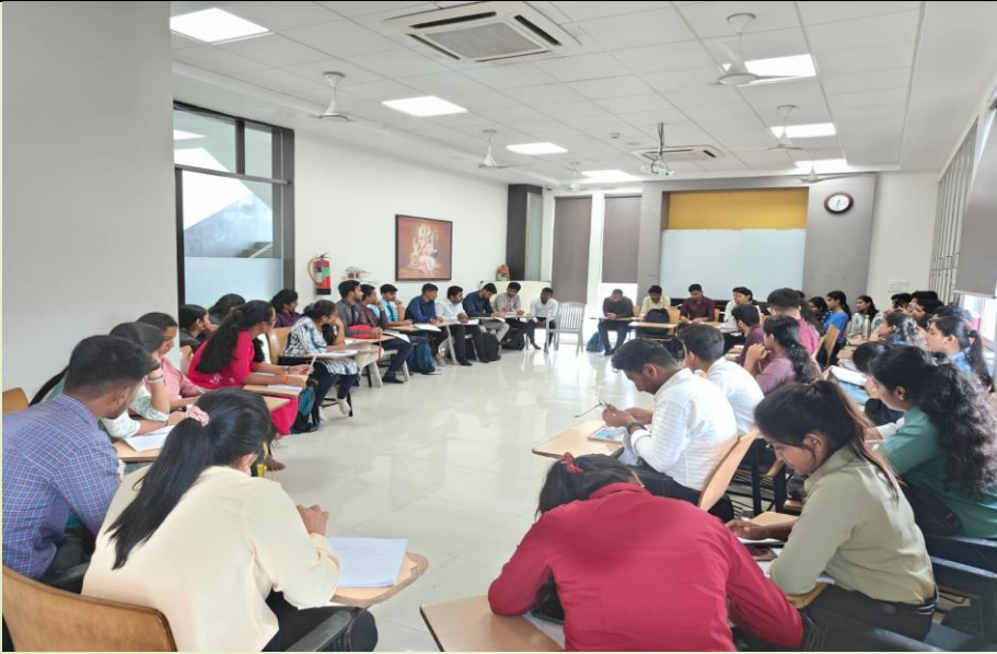
Workshop on Tally Prime on 16 th November 2024